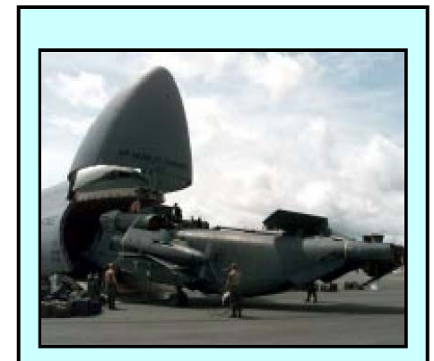
AFSOF normally require logistics support from conventional forces.

AFSOF must be able to execute time discrete deployments. Α reduced deployed logistics footprint can enhance both the timely response and the security of an operation. The system used to mobilize and deploy AFSOF should be able to function in an environment where OPSEC precludes normal predeployment coordination. However, planners must balance the need for OPSEC against the need for adequate logistics support and the size of the logistics footprint to ensure timely deployment and, ultimately, mission success. Lack of adequate logistics support can put the mission as much at risk as the failure to maintain appropriate OPSEC.