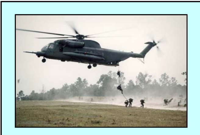
Repeated and realistic dress rehearsals make success more certain.

Rehearsal of special operations is critical. Often, repeated rehearsal of certain mission elements is necessary. This is because both personnel and essential tasks differ from mission to mission and because of the possible strategic implications of these missions. Because special operations are unique, each operation may bring together a group of specialists who have worked together infrequently or